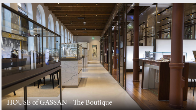
HOUSE of GASSAN - The Boutique