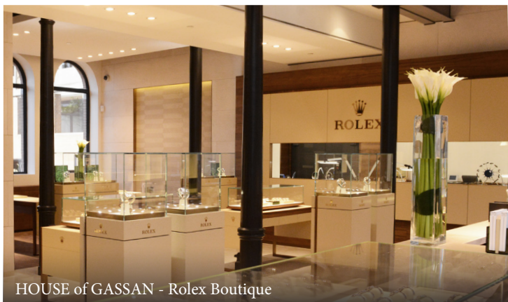
HOUSE of GASSAN - Rolex Boutique