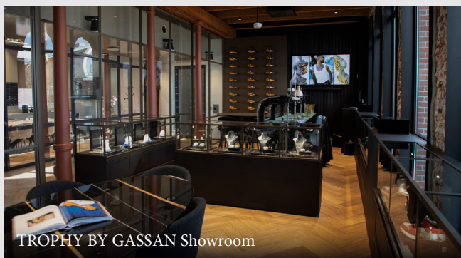
TROPHY BY GASSAN Showroom