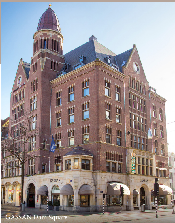
GASSAN Dam Square

GASSAN offers a unique shopping experience where jewellery and watch experts personally welcome visitors seven days a week. The exclusive VIP area offers extra comfort and privacy where one can get expert advice on diamonds, jewellery and watches and a collection of watches from more than 65 top brands such as Rolex (incl. Rolex Boutique), Cartier, Omega, Chopard, Breguet, Tudor, Messika and many others. The well-trained staff is happy to give advice to ensure that their customers go home fully satisfied with their purchase.